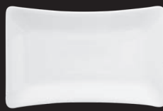
Platter 36 36 cm 1030 gr Code: 078/070/0036