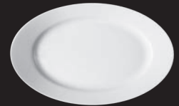
Oval Platter 45 45 cm 1044 gr Code: 007/032/0045