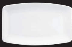
Convex Platter 36 36 cm 1056 gr Code: 082/070/0036