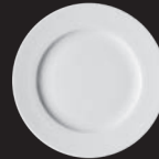
Main Dish 30 cm 840 gr Code: 001/032/0030