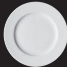
Dinner Plate 27 27 cm 557 gr Code: 001/032/0027