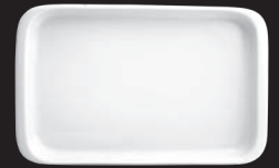
Rectangle Platter 29 29 cm 720 gr Code: 007/029/0029