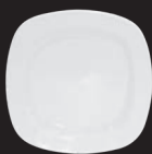
Dinner Plate 27 27 cm 850 gr Code: 001/074/0027