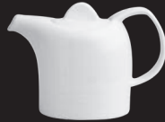
Coffee Pot 640 cc 674 gr Code: 050/049/0003