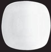
Dinner Plate 29 cm 590 gr Code: 001/061/0026