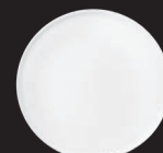
Pizza Platter 30 cm 860 gr Code: 124/049/0030