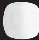
Dessert Plate 21 cm 323 gr Code: 001/061/0019