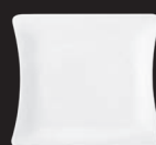
Dessert Plate 21 cm 397 gr Code: 001/070/0020