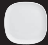
Square Plate 19 18 cm 250 gr Code: 001/029/0019