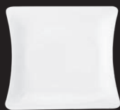
Dinner Plate 26 cm 695 gr Code: 001/070/0025