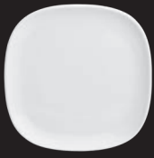
Square Plate 21 21 cm 380 gr Code: 001/029/0021