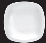
Deep Plate 23 cm 350 gr Code: 002/061/0020