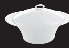
Soup Tureen & Lid 1600 cc 930 gr Code: 008/070/0006