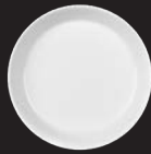
Flat Plate 30 30 cm 890 gr Code: 001/118/0030