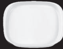
Rectangle Platter 19 20 cm 460 gr Code: 007/029/0019