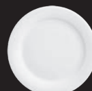
Dinner Plate 27 28 cm 780 gr Code: 001/049/0027