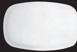
Rectangle Platter 38 cm 1115 gr Code: 078/061/0038